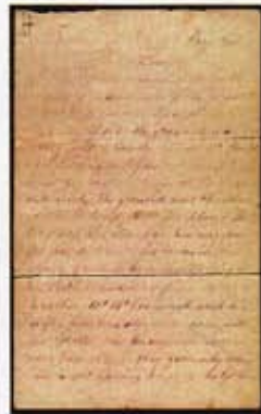
Clockwise from top: Ned Kelly: the Rock Opera 1974. The Jerilderie letter A Man of Wealth & Taste Vintage silver gelatin Robert Whitaker 1969