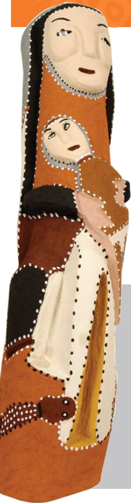
Shirley Purdie, Ngalangangpum – Mother & Child (2008), 100 x 27 x 27cm; natural ochre and pigments on wood carving; Warmun Art