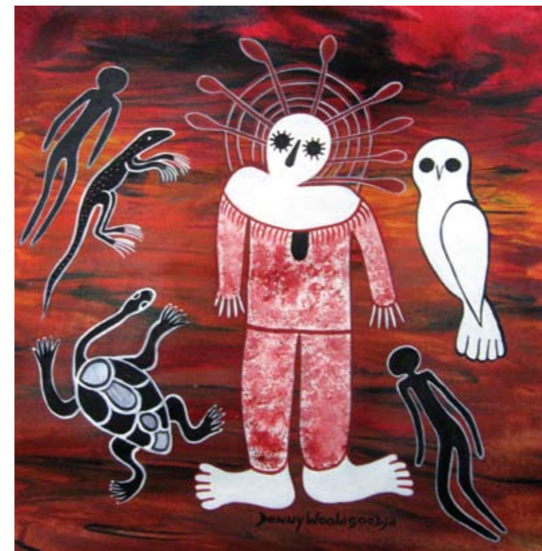
Donny Woolagoodja, Wandjina, Gyorn Gyorns and Unguds (2008), 46 x 48cm; acrylic on canvas; Mowanjum Arts